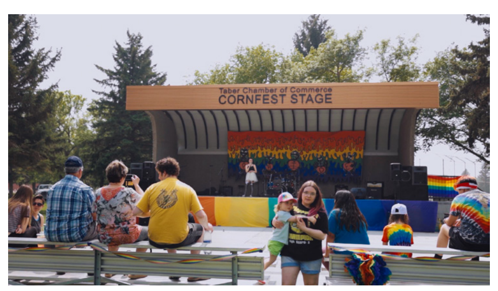
Residents gather at the main stage for Pride Day at Taber Pride 2019.