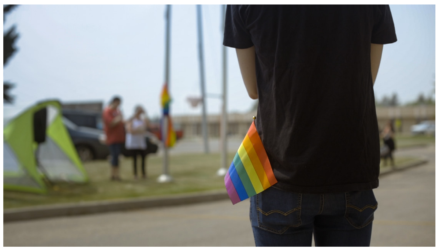
Residents of Taber, Alberta celebrate the flag raising at Taber Pride in 2019.

Small Town Pride offers an intimate look at the joys and challenges of being queer in a small town. Filmed in Alberta, Nova Scotia and the Northwest Territories, the film follows LGBTQ2S+ people and allies as they prepare for their local Pride celebrations. Organizing in church basements, classrooms and around kitchen tables, they take on a conservative town council that won't fly a rainbow flag and bend some rules to create a safe space for youth to come out. Despite experiences of isolation and discrimination, they love their communities and strive to make them places where everyone, no matter who and how they love, can live and thrive.